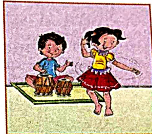
music and dance